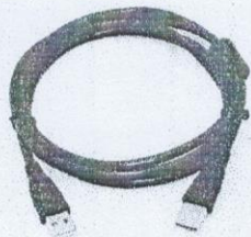
Type-A USB data line

The reader is connected to the PC through USB data line like below;