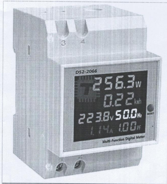
This image is only for illustration

Note - Supplier should indicate Make, Model, country of origin and warranty condition of the offer.