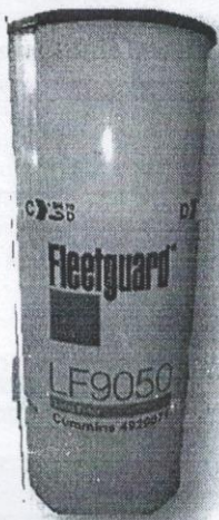
Lub Oil Filter LF 9050 (Cummins 4920071)