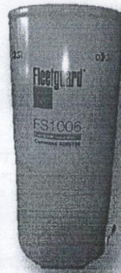
Fuel Separator Filter Element FS 19765