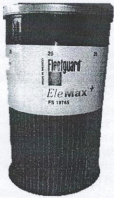
Fuel Filter FS 1006 (Cummins 4095189)