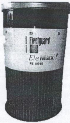
Fuel Filter FS 1006 (Cummins 4095189)