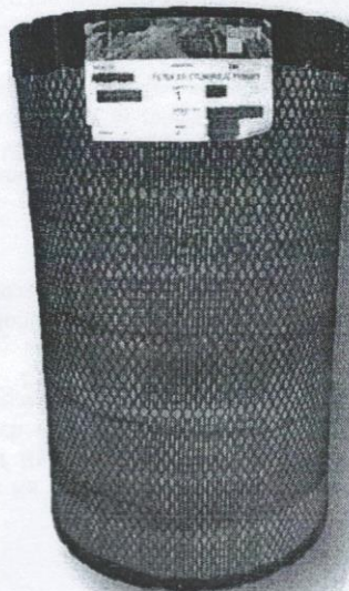
Filter Air Cylindrical Primary AF25708M