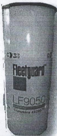
Lub Oil Filter LF 9050 (Cummins 4920071)