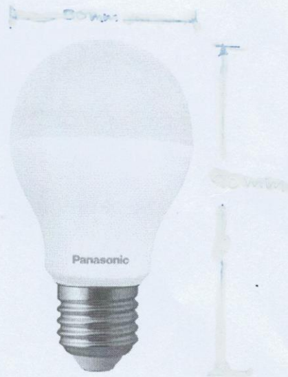
This image is only for illustration