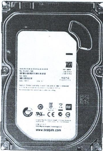
.TB SV35 SATA Hard