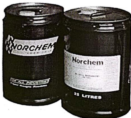
This image is only for illustration

Note: Make or part No. to be clearly indicated by the bidder and the expiry date should be at least after one year from the date of supply of the item.