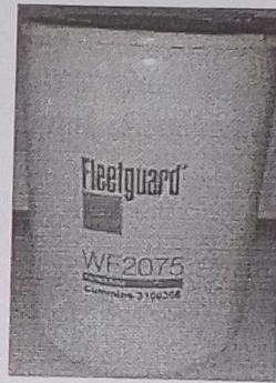
Coolant Filter WF 2075 (Cummins 3100308)