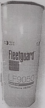
Lub Oil Filter LF 9050 (Cummins 4920071)