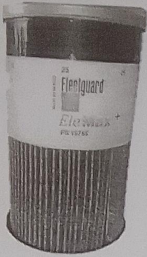
Fuel Filter FS 1006 (Cummins 4095189)