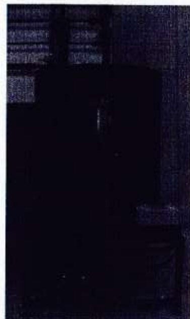
Fig. 5 Friction Loss In Pipes Apparatus