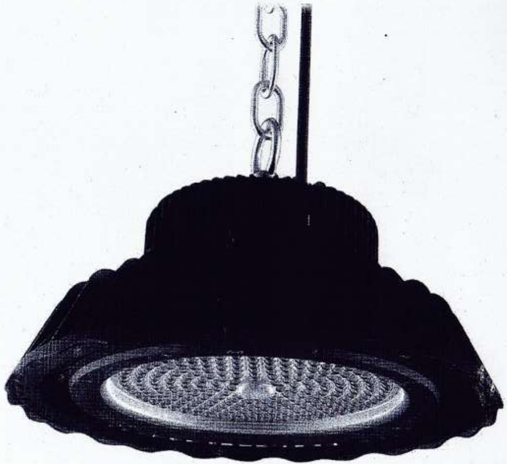
High bay LED light