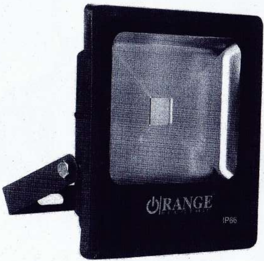
LED Flood light Lamp