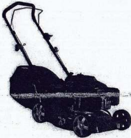
Lawn Mowing Machine