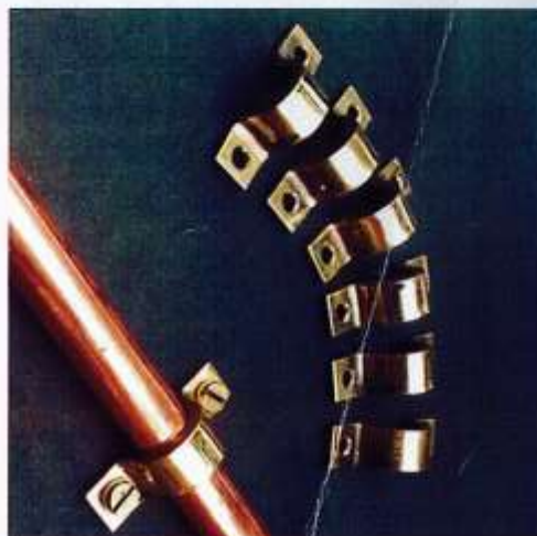
BRASS PIPE OR SILVA PIPE WITH CLIPS