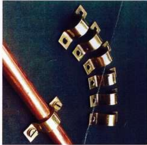
BRASS PIPE OR SILVA PIPE WITH CLIPS -