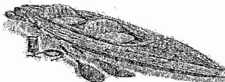
Double Kayak Boat