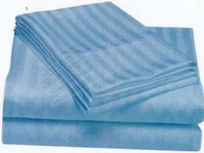
Bed Sheet Dubble (Light Blue Colour) 180 x 200cm