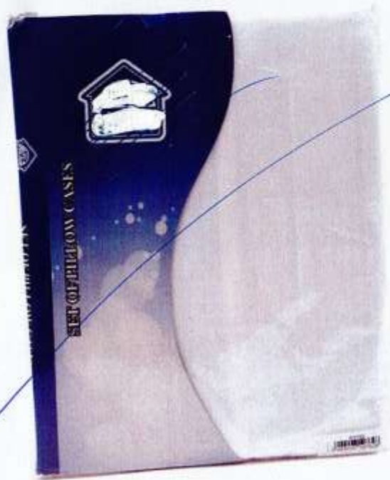
Pillow Case 2Pcs Plain Cotton 18"x27"