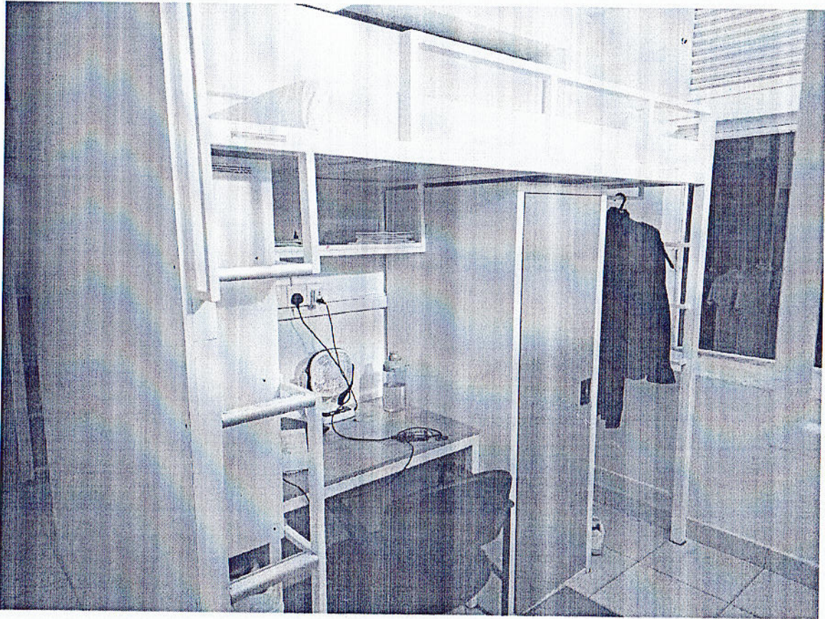
Annexure A: Hybrid Bed