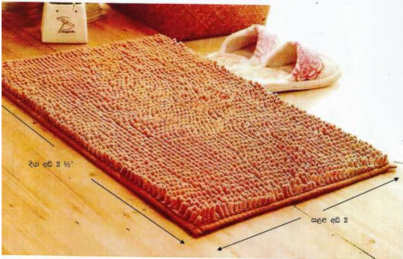
Barthroom Carpet 2 1/2' x 2'