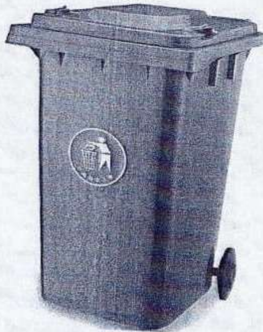
240 Liter Plastic Dustbin with 2 Wheels

APRIL 2018 ADITHYANWAR DEFENCE UNIVERSITY KATIPWALA ESTATE, RATMALANA.