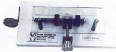
196-001 Rack & Pinion Apparatus

The working parts of the apparatus are covered by a transparent guard.