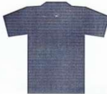
නිල් පාට වී ෂර්ට්ස් පසුපස පෙනුම