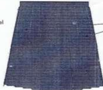
නිල් පාට සාය ඉදිරිපස පෙනුම