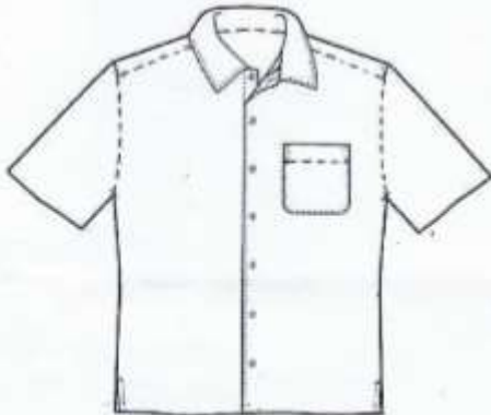
සුදු පාට කමිසය