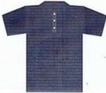
නිල් පාට වී ෂර්ට්ස් ඉදිරිපස පෙනුම