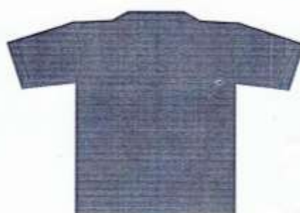
නිල් පාට වී ෂර්ට්ස් පසුපස පෙනුම