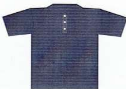
නිල් පාට වී ෂර්ට්ස් ඉදිරිපස පෙනුම