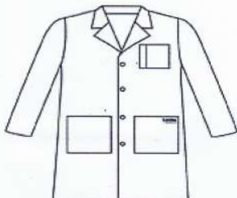
විද්‍යාගාර කඩාය ඉදිරිපස පෙනුම