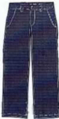
නිල් පාට කලිසම් ඉදිරිපස පෙනුම