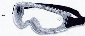
Figure No. 7.0