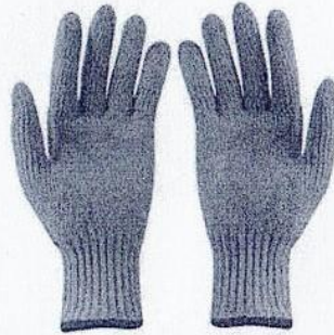
Figure No. 5.0