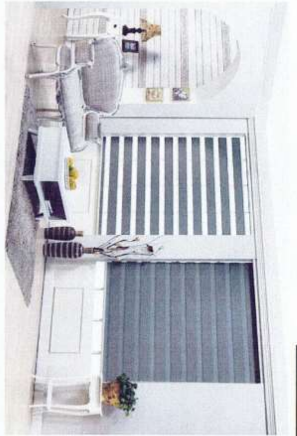
SAMPLE IMAGE FOR BLINDS