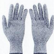
Figure No. 1.0