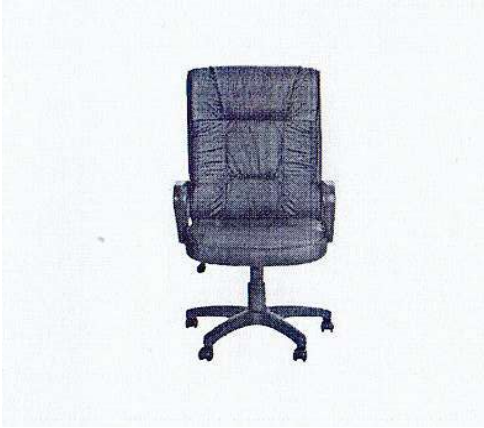
SR No 02- Low Back Chair Swing