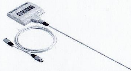
Figure No. 1.0