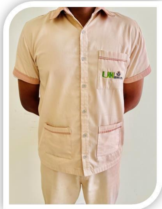
DRESS CODE FOR BOY