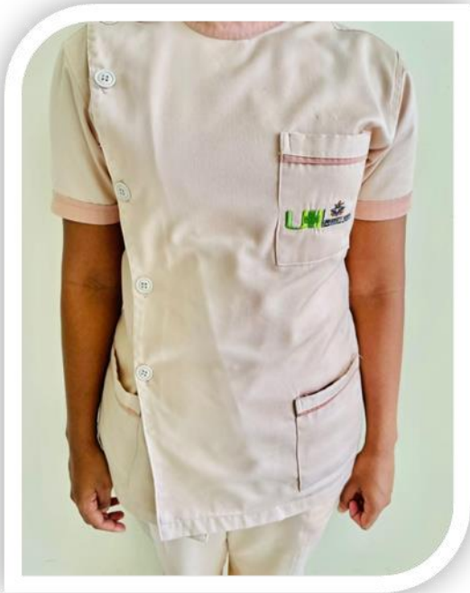
DRESS CODE FOR GIRL